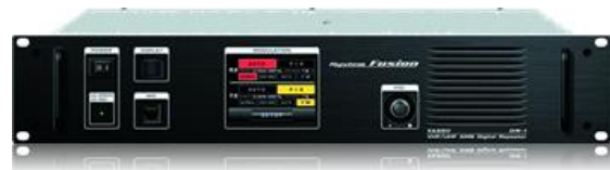
LC Echo 440 Repeater Yaesu DR-1X 442.925 MHz 100 HZ PL