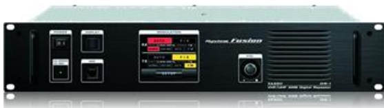
LC Echo 2 Meter Repeater Yaesu DR-1X 147.080 MHz 100 HZ PL

Doug Chauvin, N8PYN 29112 Elmwood St. St Clair Shores, MI 48082 (586) 775-1891 dougn8pyn@ameritech.net